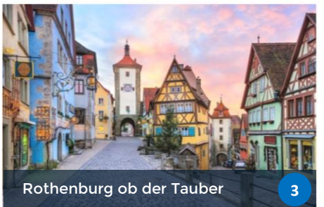
Rothenburg ob der Tauber